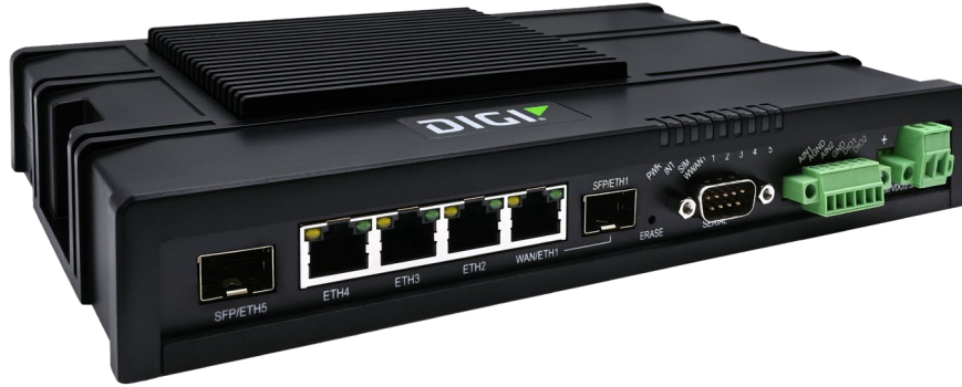
Digi IX40 — front